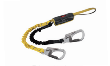
Tofana II. lock